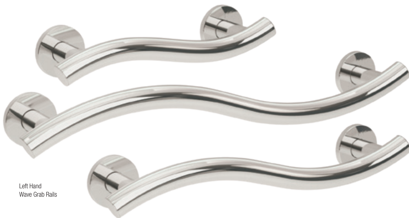
Left Hand Wave Grab Rails